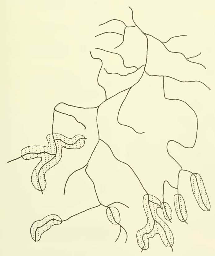
Fig. 2. Area of Clearwater River basin occupied by C. confusus.

The findings of this study indicate that species of sculpins in the Clearwater system can be grouped into two major assemblages based on the distribution of C. confusus vs. the distribution of the C. rhotheus , C. bairdi , and C. beldingi complex. The data did not allow identification of the factor or factors limiting each species group. However, C. rhotheus , C. bairdi , and C. beldingi would appear to be generally responding to the same factor or factors. We believe that partitioning of resources is probable among C. bairdi , C. rhotheus , and C. beldingi in areas of coexistence, and that extreme competition occurs between that complex and C. confusus (X²